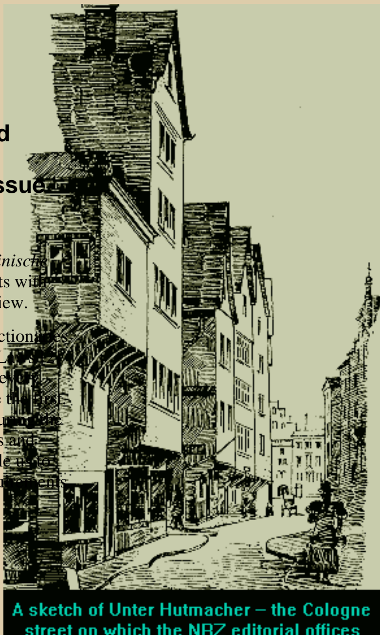
A sketch of Unter Hutmacher – the Cologne street on which the NRZ editorial offices